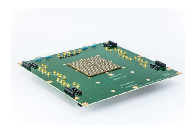
\llbracket \text{FutureAccess}^{\text{TM}} \rrbracket \quad 2 \times 2 \text{ PAAM}