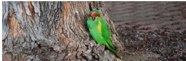
Fig. 3. A figure which spans two columns must be placed either at the top of a page or at the bottom of a page. Figure caption with more than one line must be justified. Figure caption with only one line must be centered.

You must follow the formats as shown in this template. You must not use alternative styles which are not used in this template (e.g. two-author block).