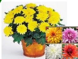
Mums—12"-18"H $20.00/$30.00 each

Visit www.tlc-florist.com for additional sample pictures. For free design assistance, please call 770-507-6777 or email order@tlc-florist.com with any questions.