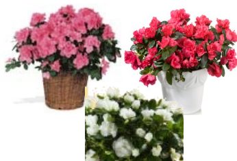
Azaleas—12"H $35.00/$45.00 each