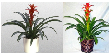
Bromeliads—12"-18"H $35.00/$45.00 each