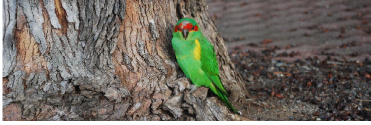
Fig. 3. A figure which spans two columns must be placed either at the top of a page or at the bottom of a page. Figure caption with more than one line must be justified. Figure caption with only one line must be centered.

Check all figures in your paper both on screen and on a black-and-white hardcopy. When you check your paper on a black-and-white hardcopy, ensure that: